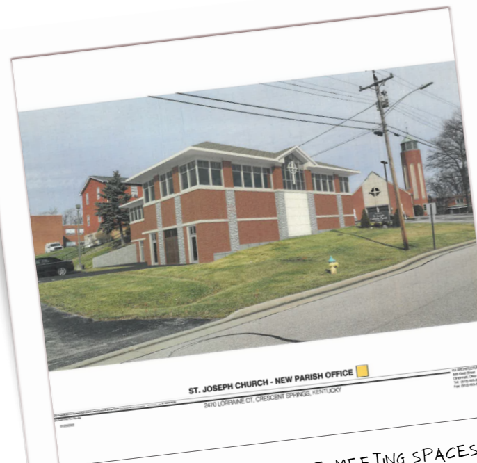
ST. JOSEPH CHURCH - NEW PARISH OFFICE 2470 LORRAINE CT, CRESCENT SPRINGS, KENTUCKY

CHURCH INTERIOR THAT REVERBERATES THE SACREDNESS OF THE SACRAMENTS OF YOUR FAMILY'S LIVES