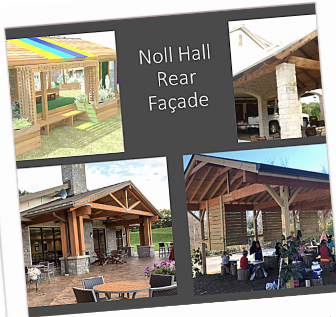
Noll Hall Rear Façade

NOLL HALL WITH A COVERED ENTRANCE SUITABLE FOR OUTDOOR PARTIES AND LEARNING