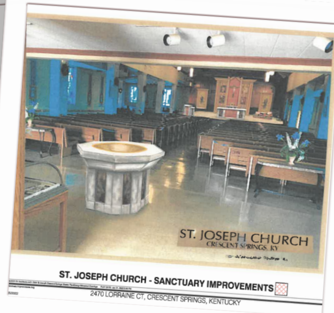
ST. JOSEPH CHURCH CRESCENT SPRINGS, KY

NOTE: THESE ARE DESIGN CONCEPTS ONLY MEANT TO PROVIDE INSPIRATION AND SHOW POTENTIAL. THEY ARE PRELIMINARY AND WILL CONTINUALLY BE REVISED BASED ON FEEDBACK RECEIVED AND INCOMING INFORMATION. UPDATES WILL BE SHARED WITH THE PARISH AS THEY BECOME AVAILABLE.